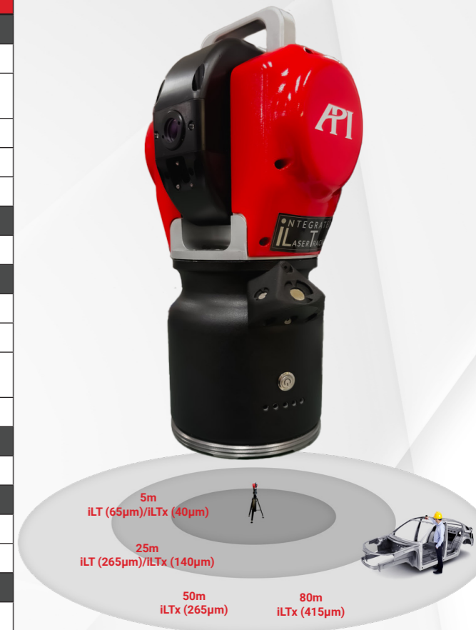
VOLUMETRIC ACCURACY (MPE)